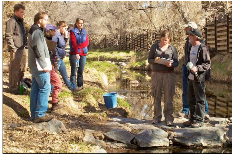
This photo was taken at the SCWK (Silver City Watershed Keepers) event this past March on the location in the Big Ditch which is the first of three monitoring locations on San Vicente Creek.