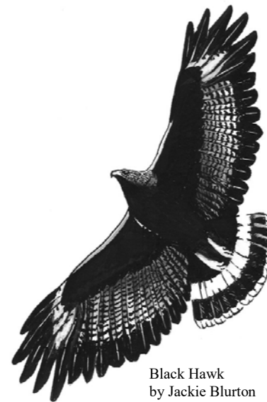
Black Hawk by Jackie Blurton

Habitat: Riparian woods, pinyon-juniper forest.